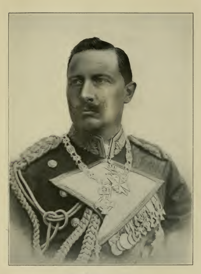
THE EMPEROR IN 1900